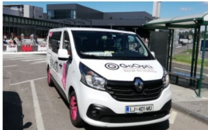
GoOpti point at the shuttle van station located next to the passage to the garage.

If you cannot find the driver and are lost, you can call +38651241434 and ask for Ursa for assistance.