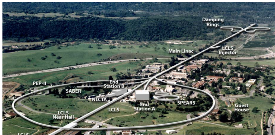
Goal: Lab scale EUV/X-ray Free Electron Laser