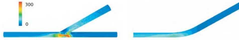
Conventional End-to-Side Anastomosis